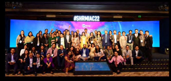
SHRM India staff at SHRM India Annual Conference 2022

The SHRM MENA Annual Conference featured the launch of BWCC 2023 competition, which announced a new Member Track, exclusive to SHRM members who are entry-level to midlevel HR professionals. In 2023, SHRMLabs aims to reach even more workplace tech startups and HR professionals globally.