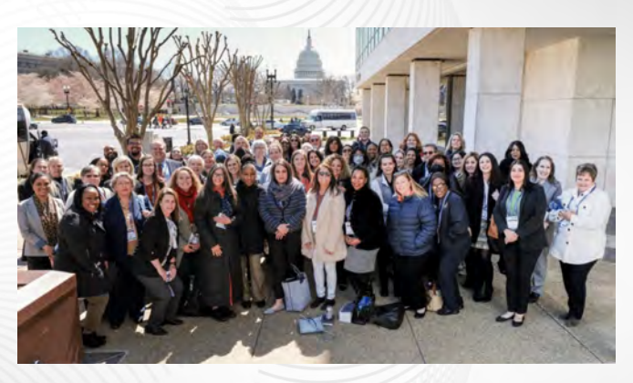
Workplace Policy Conference attendees traveled to Capitol Hill for small group meetings with members of Congress, congressional staff and workplace policy advocates.