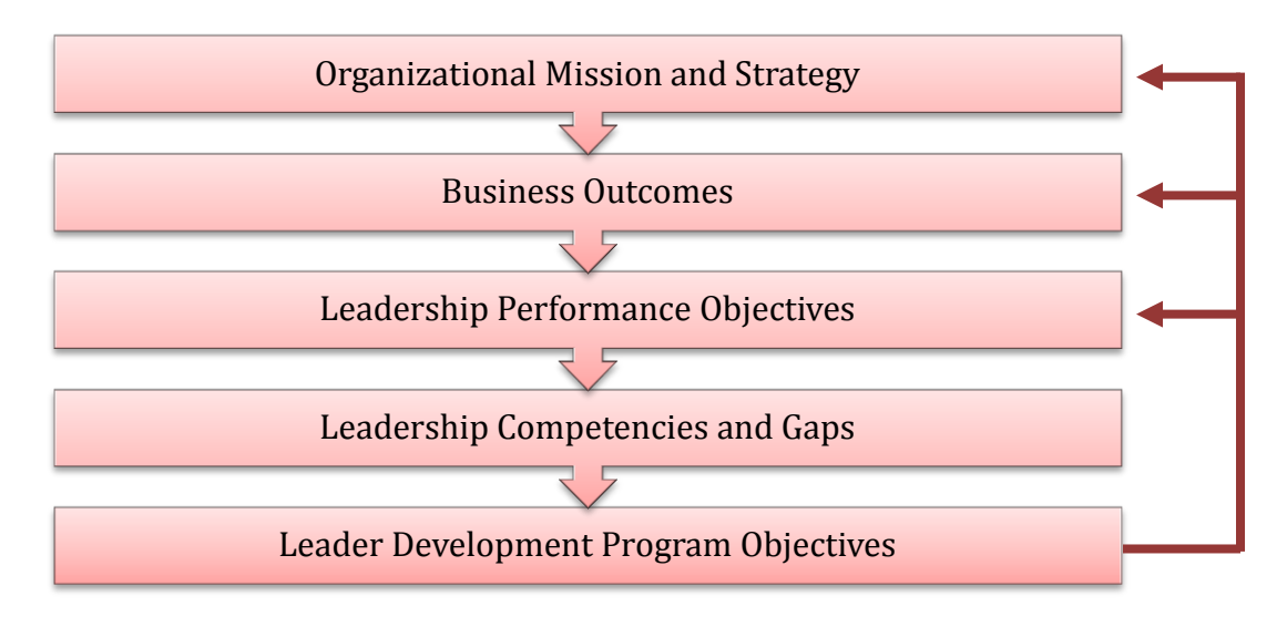
Figure 1. Framework for a Leader Development Program Business Case

imperatives, defines leadership competencies and links those competencies with important business outcomes. Before finalizing program objectives, it is important to determine what leadership competency gaps exist in the workforce and ensure that the objectives address critical competency shortages. Figure 1 depicts key linkages that can serve as a framework for the business case and input to program design.